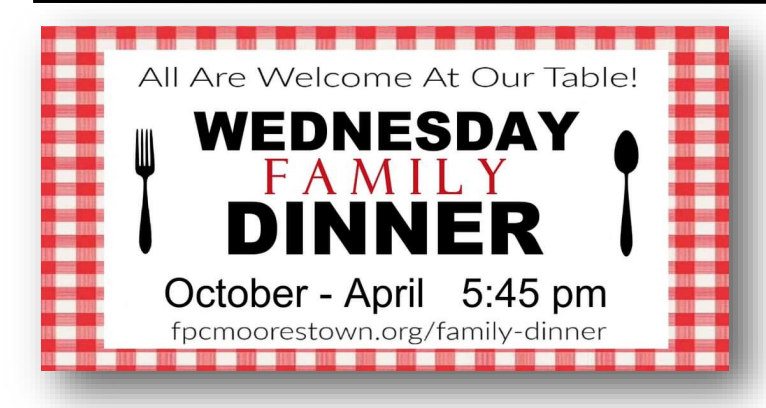
$7.00 per person; pay via Venmo or at the door