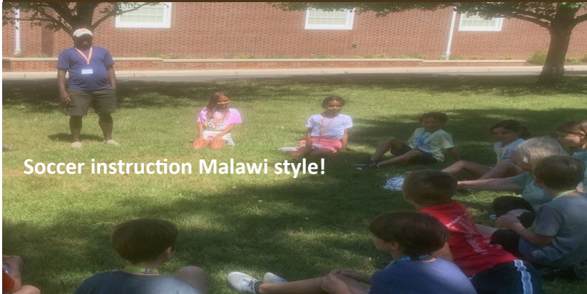
Soccer instruction Malawi style!