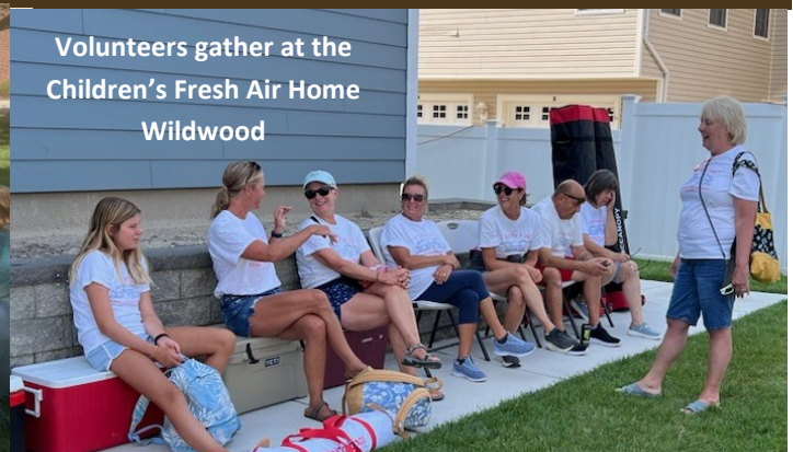
Volunteers gather at the Children's Fresh Air Home Wildwood